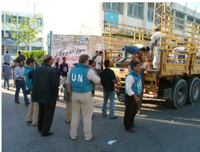
Operations Support Officers escorting a relief convoy, Rafah, May 2004.