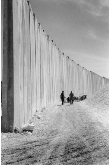
Shepherds by the Jerusalem wall, Abu Dis, West Bank.

Israel has imposed heavy restrictions on the road networks, preventing Palestinians from travelling on major highways between urban centres in the West Bank. According to the Israeli human rights organisation B'Tselem, Israel restricts Palestinian travel on forty-one roads and sections of roads throughout the West Bank, totalling more than 700 kilometres (km) of roadway (6) . Palestinian travel is also regulated through a complex system of permits, regularly subject to change without notice, by which Israel allows some Palestinians access to Jerusalem and to the 'seam area' between the wall/fence and the 1967 "Green Line."