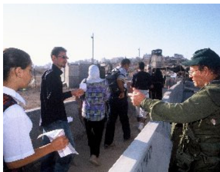
West Bank checkpoint.

In its previous emergency appeals, the Agency made special provisions for requirements to enhance its operational and logistical capacities and cover other emergency related expenses. Additional vehicles and communications and other types of equipment have been procured, additional staff have been recruited under the emergency employment generation programme, essential staff have been compensated for working additional hours and hotel accommodation expenses plus meal allowances have been covered for some key staff members from the middle and the south of Gaza. These additional pressures on the Agency's budget remain and so are included as part of this Appeal. There is also the need to extend the position of the Emergency Programme Implementation Officer (EPIO) for a further twelve months which provides a key monitoring role for the Agency's emergency programming.