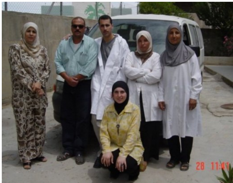
Mobile medical team, West Bank.