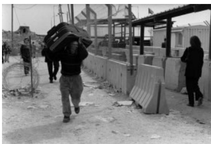
Kalandia checkpoint, West Bank.

Internal closure in the West Bank is often reinforced by curfews. During the twenty months from June 2002 - February 2004, Hebron was under curfew 40 percent of the time, Nablus 32 percent, Tulkarem 31 percent, Jenin 26 percent, Bethlehem 18 percent, Ramallah 17 percent and Qalqilya 15 percent (5) .