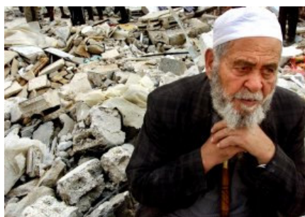
Homeless refugee, Rafah camp, Gaza May 2004.

In the Gaza Strip, UNRWA seeks to continue extending cash assistance to families facing severe economic hardship to help them meet their most urgent basic needs. In the majority of cases, amounts will be disbursed to the families who have lost their main source of income either due to unemployment, imprisonment or the death of the main breadwinner. In the main, funds are used to cover the cost of essential items such as food, clothing and schooling supplies and to pay utility bills. Specific grants are made available to cover hospital fees and funeral expenses.