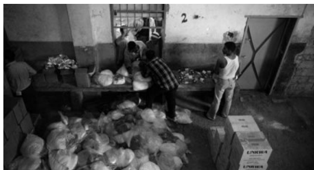
UNRWA food distribution centre, Khan Younis, Gaza.

Previous research shows that children are particularly vulnerable to deficiencies in their levels of food and micro-nutrient intake (22) . Likewise, women are disproportionately affected by food insecurity, as in times of scarcity they tend to feed men and children with protein, while substituting protein with additional carbohydrates in their own diets.