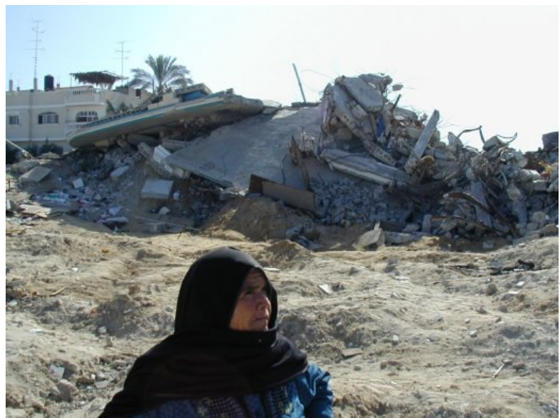
Demolished zone, Rafah camp, Gaza, November 2004.

In Rafah, southern Gaza, the Israeli army has continued operations to clear the border line with Egypt of housing, ostensibly with the objective of destroying tunnels. Whilst these operations reached their peak in May 2004, demolitions have continued since then: this has resulted in an inexorable rise in levels of destruction. The rate of home demolitions increased from 15 homes per month in 2002, to 77 homes per month in the first nine months of 2004 in Rafah alone. Finding temporary accommodation for the victims, and later house reconstruction, has been a priority for UNRWA. However, funding shortfalls in 2004 meant that the Agency was only able to cover rental assistance, and the pace of reconstruction has lagged far behind that of demolition. With rates of demolition so high in southern Gaza, even available accommodation for rent is becoming increasingly scarce.