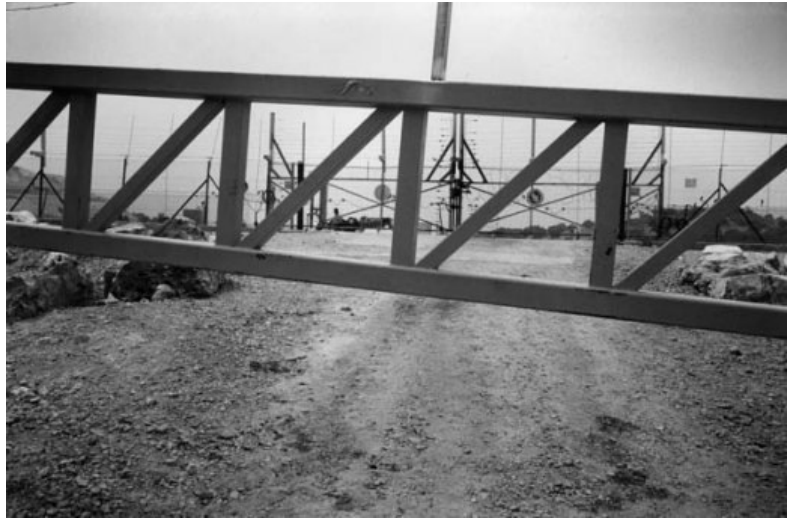
Gate in the West Bank wall/fence, Qalqilya, West Bank.