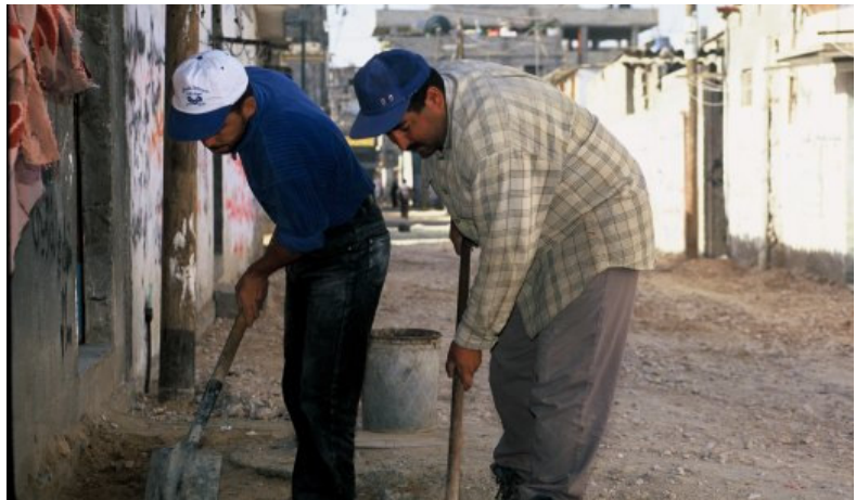
Emergency job creation programme, Gaza Strip.

Under the Direct Hire component of this programme, UNRWA plans to provide over 2.6 million job days in 2005. In Gaza, the 1,900,000 workdays proposed will benefit over 200,000 refugees (jobholders plus dependents) and employ up to 6,800 persons each month and a total of 27,200 over the year. In the West Bank, 787,800 job days will be created to the benefit of 8,619 individuals and their dependents in 2005. Both Fields rotate job opportunities on a three monthly basis for most posts to ensure that benefits are spread as widely as possible whilst maintaining effectiveness.