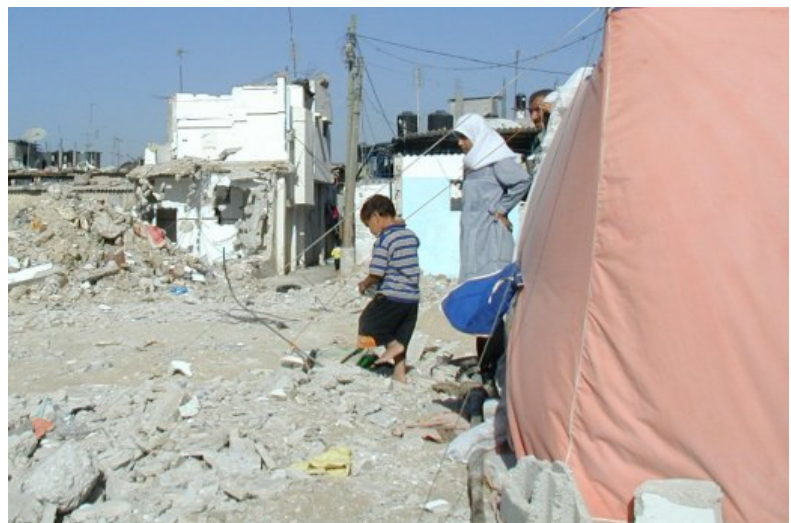
Jabalia camp November 2004.

This past year has seen a continuation of violence, loss of life and by far the worst levels destruction since the outbreak of the intifada . UNRWA statistics do little to convey the real amount of suffering.