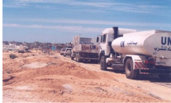
UNRWA relief convoy, Rafah, May 2004.

UNRWA is mandated by the UN General Assembly to provide education, health, relief and social services to Palestine refugees. In spite of this clear expression of will from the international community, the Agency continues to face significant obstacles placed in its path in the fulfilment of this mandate in the oPt.